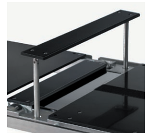
Power Kidney Bridge for Safe and Easy Positioning