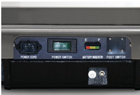
Battery Life Indicator

700 lbs. Lift and 600 lbs. Articulating Capacity