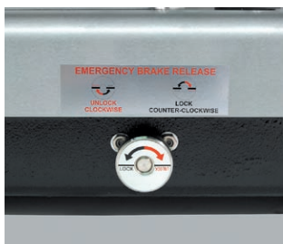
Manual Emergency Brake Unlock