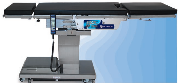
13-1/8 inch Slide to Foot