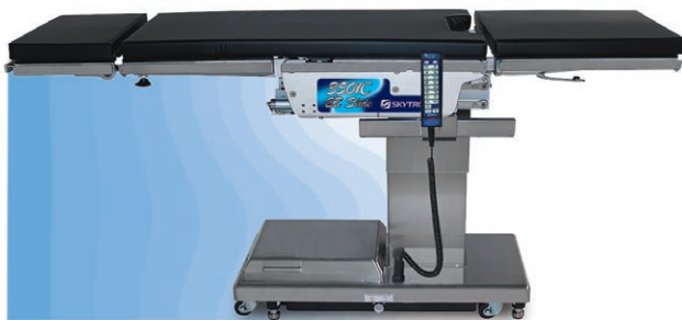
7-5/8 inch Slide to Head

The EZ Slide 3501C Top Slide surgical table is designed to meet O.R. suite demands of the 21 st Century, including an impressive range of full body imaging and articulating table functions as required for C-arm imaging, without multiple accessories or having to reposition the patient. One touch of a button does it all!