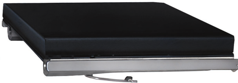
Exclusive 21 inch Top Slide