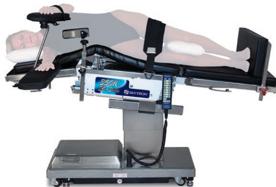
Kidney / Thoracic