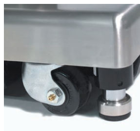
Self Leveling Brakes for Stability on Uneven Floors