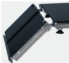
Adjustable Head Section with Quick Release Bar for Emergencies