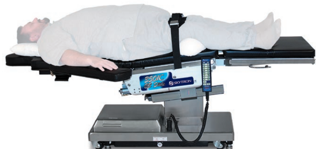
Ophthalmic / ENT