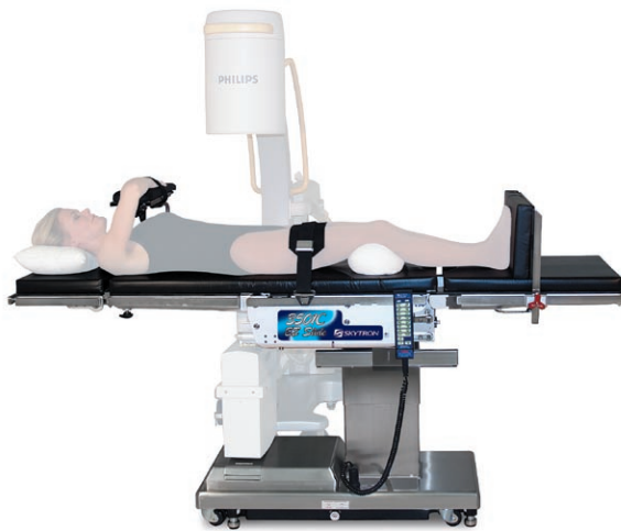
Gall Bladder / Thoracic