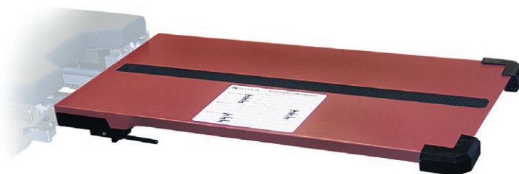
Optional 40 inch Carbon Fiber Extension for Specialty Imaging Requirements