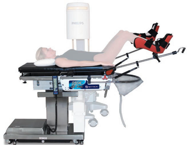
GYN / Endourology / Cystoscopy