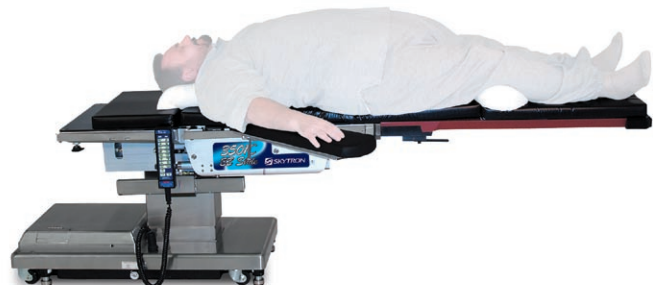
Lower Extremity / Endovascular / Podiatry