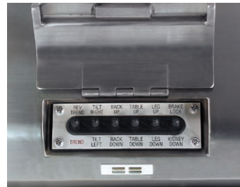
Secondary Function Switches for Backup to Primary Control