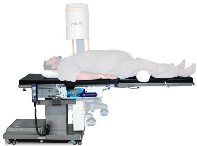
Vascular / Endovascular