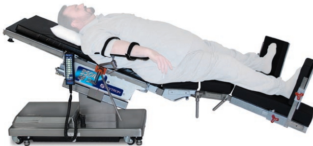
Gastro / Intestinal