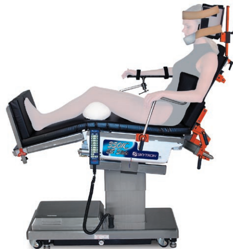
Shoulder / Arthroscopy