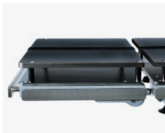
Full Length X-Ray (Bucky) Top Accessory for Image Capture