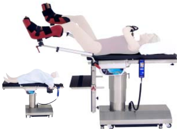
OB/GYN & C-Section