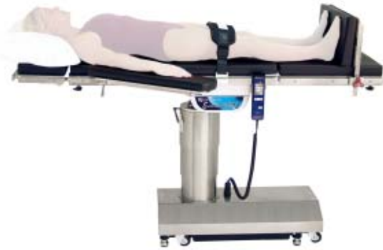
Upper Body Imaging