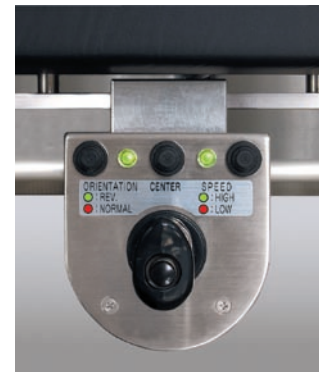
Joy Stick Controller