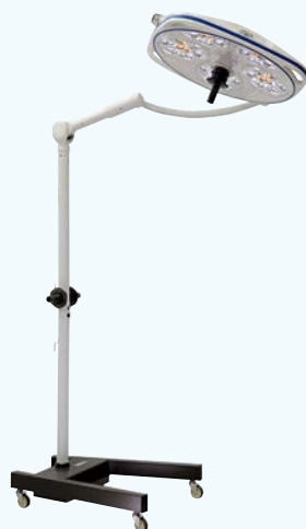
Also available on a mobile stand